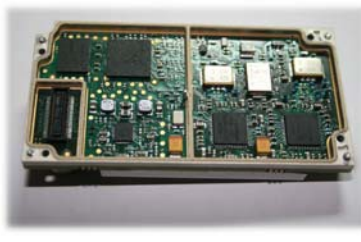
Figure 2: 9523 Bottom View