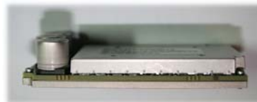
Figure 3: 9523 Left Side View