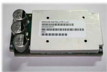
Figure 1: 9523 Top View